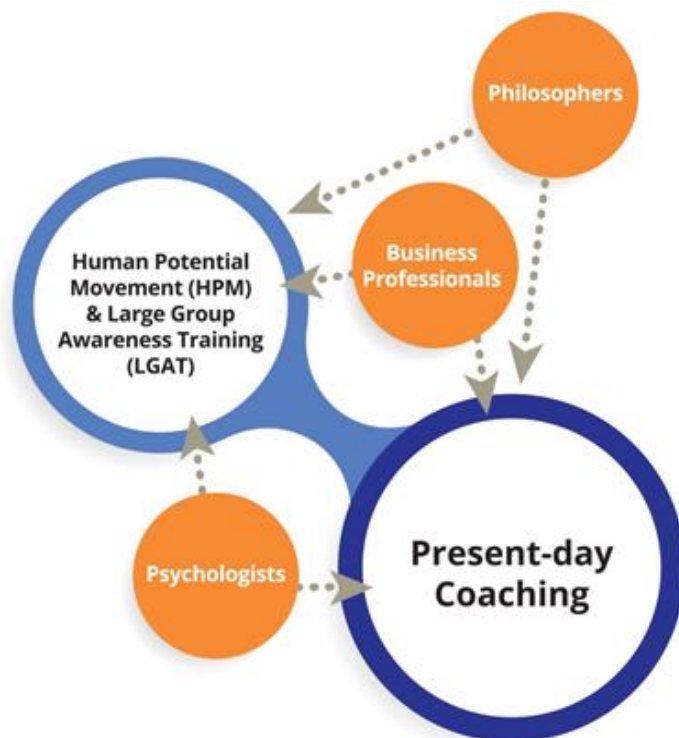
Figure 2. Influences on Coaching

Carl Rogers was one of the founders of the field of humanistic psychology. He emphasized the need to focus on and maintain a presence with the client (Rogers, 1957). Albert Bandura, a social psychologist, provided a significant contribution to